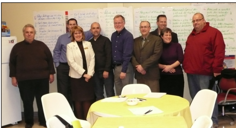
The Main Street board of directors strategic planning meeting